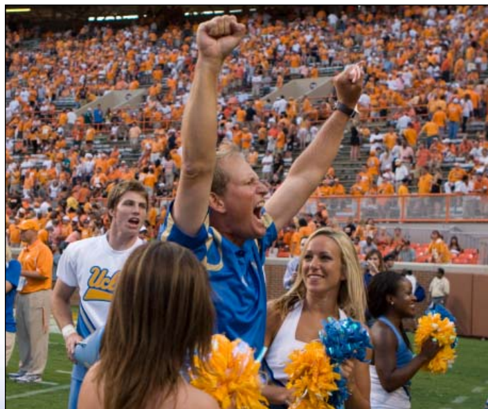
Head Coach Rick Neuheisel raises his hands in victory as he walks off the field after UCLA's big win over Tennessee in Knoxville.

During his four seasons (1999-2002) as head coach at the University of Washington, Neuheisel guided the Huskies to a record of 33-16 (.673) and