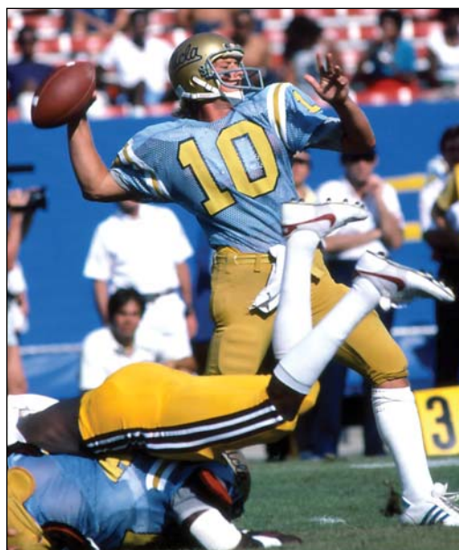
Neuheisel was the MVP of the 1984 Rose Bowl

four bowl games (one Rose Bowl, two Holiday Bowls and one Sun Bowl). His Pac-10 record was 23-9 (.719) and Washington captured one league title and finished second twice in those four seasons. The Husky offense averaged over 390 yards per game in each season, topped by a 420.7 mark in 2002 (17th in the nation) and 407.9 in 2000 (35th).